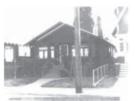
Approved by the Planning Department in 1993. Second story added, front porch partly enclosed and entire building covered with vinyl siding. Original surfaces were wood shingles. Horizontal aluminum slider windows added which are inconsistent with the original Craftsman style