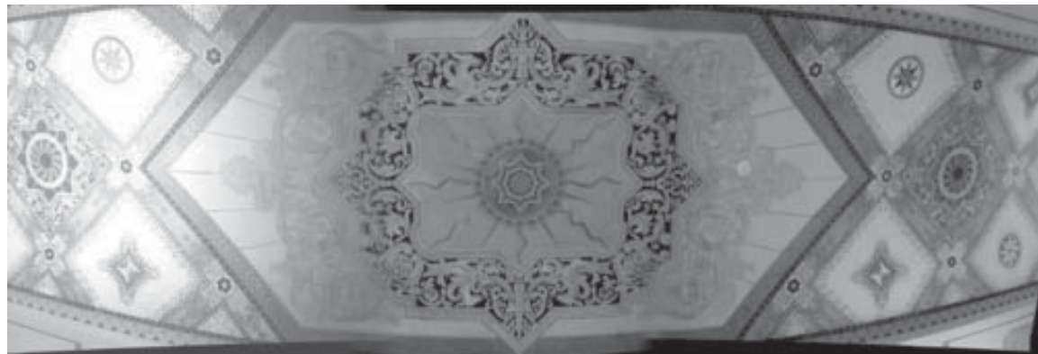
Alameda Architectural Preservation Society

This presentation will be an exciting look on how people are preserving our local buildings history and beauty.