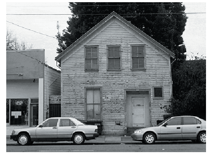
2320 Lincoln Ave

The City is considering enlarging the site for the new Main Library to include two buildings at 2320 and 2322 Lincoln Ave. Both buildings would be demolished to allow construction of a 96 space surface parking lot for the Library. The surface lot requires more land because it would replace an originally planned two-level parking garage.