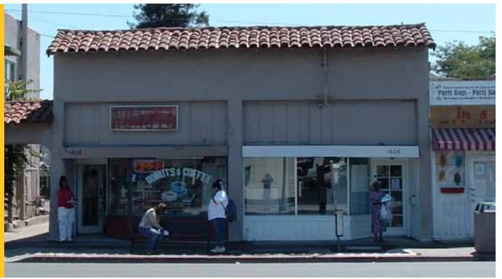
Plywood and other 'alien' materials were removed from the tiled bulkheads, which were reconstructed. The transoms had been poorly maintained; some of the windows were painted over, and others were smothered with plywood.