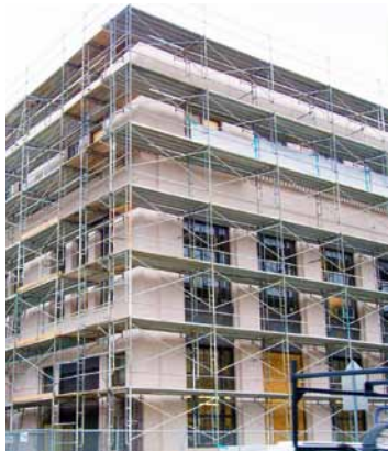
The window rehabilitation project at the Alameda Adult School wing is the first phase of a larger effort to rehabilitate all of the historic wood windows at the Historic Alameda High School.