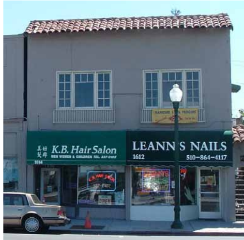
In 1939, both the Gochnauer Building and its neighbors were modernized in the "Spanish" style.