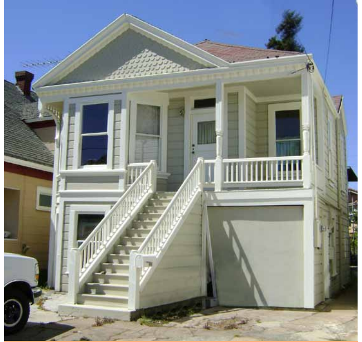
The Queen Anne cottage with reconstructed wood windows, replaced shingle siding, porch repaired, new stairs, replaced trim details, and rustic groove siding.