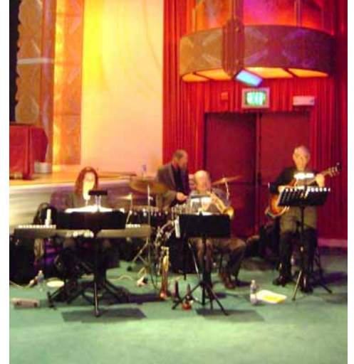
The Franz-Nichols Band provided music for the reception and throughout the award presentations.