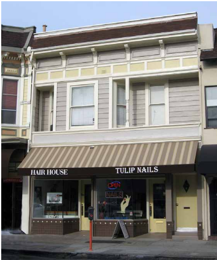
Continuity of ownership helped preserve the Hally Building's upper Victorian facade: brackets, panels, a turned post, wood trim, and ship lap wood siding were intact as were the double hung windows.

Alameda's first commercial district developed along Park Street in the 1880's. At the turn of the Century, the area had assumed the stature of a proper downtown and Alameda had transformed from a semi-rural community of about 6,000 residents to a suburb of about 20,000. Between 1880 and 1905, downtown had grown to eight blocks along Park Street and the stock of commercial buildings doubled to about 150 structures. Commercial development spread along Santa Clara and several other cross streets which is when Mr. Hally built his grocery store in 1892 for a cost of $2,000.