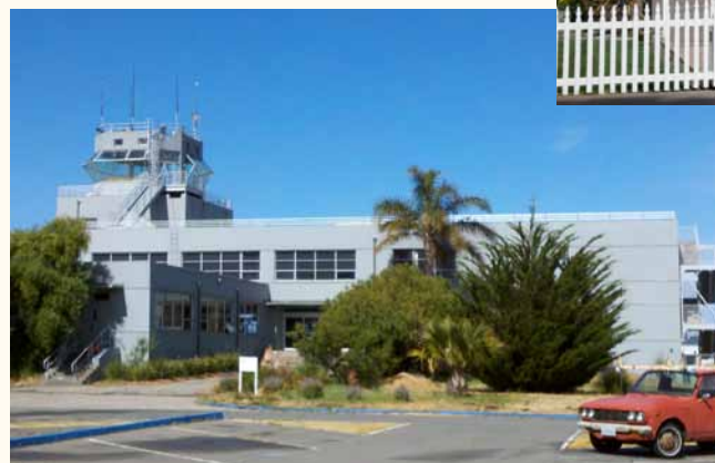
Flight Control Tower, Naval Air Station Alameda