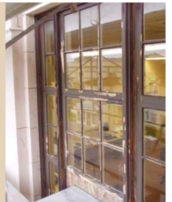
A close-up of failing paint and dry rot on the windows. The windows on the Adult School wing were in the most deteriorated condition, with the windows on the south and east elevations in the most dire condition.

The careful attention to historic preservation methods in repairing and replicating the wood windows on the Alameda Adult School maintained a pivotal aspect of the architectural significance and beauty of Historic Alameda High School, and serves as a model for local best practices in wood window restoration. The historic value of Alameda’s classical revival high school and the tremendous contribution the historic windows make to its character shine anew, peeling paint and damaged frames giving way to crisp, clean lines and a vision of the civic monument that first greeted Alamedans in 1926.