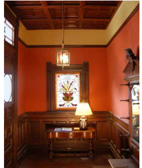
The entrance to the home with curly redwood wainscoting, a lovely art glass window and a spectacular coffered ceiling.

and appropriate cabinets that blend well with the rest of the house.