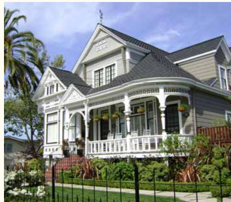
1223 High Street