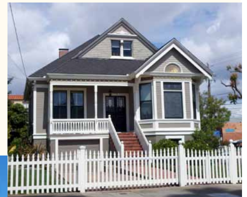
1547 Everett Street