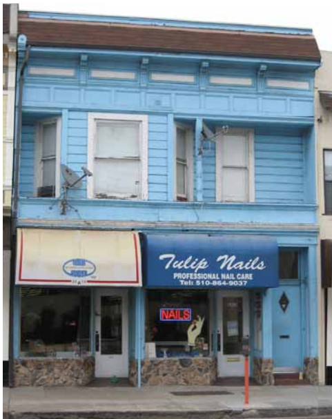
Peeling paint, stone siding, and mismatched doors and awnings from bygone tenants graced the old storefront.