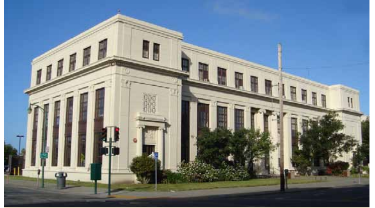
The careful attention to historic preservation methods in repairing and replicating wood windows on the Alameda Adult School maintained a pivotal aspect of the architectural significance and beauty of the school.

This tradition of community stewardship continues to the present day with the Alameda Unified School District’s work to repair, rehabilitate, and retain historic wood windows on the south wing of the Historic Alameda High School, which now houses the Alameda Adult School. As the high school approached its 80th birthday in the early 2000s, the venerable building’s unique double-hung sliding and triple-hung awning sash, many with ornamental metal-clad spandrels, were showing their age. Failing paint, dry rot, and inoperable sash were a blemish on the building and a problem for staff and students. The windows on the Adult School wing were in the most deteriorated condition, with the windows on the south and east elevations in the most dire condition.