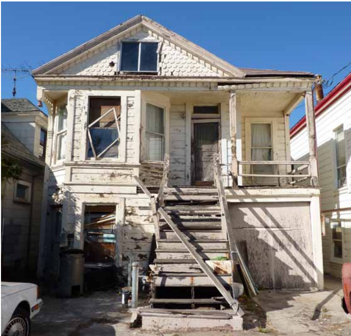
Over the years the structure had been added onto at the rear to accommodate the growing family. The original building remained intact, however it began to fall into disrepair.