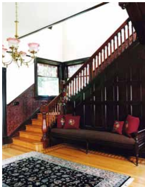
View of the entry hall, showing paneled staircase with mahogany banister and art-glass windows on lower landing.

The PowerPoint presentation will include numerous historic and contemporary images to elucidate the history, setting, and architecture of this notable