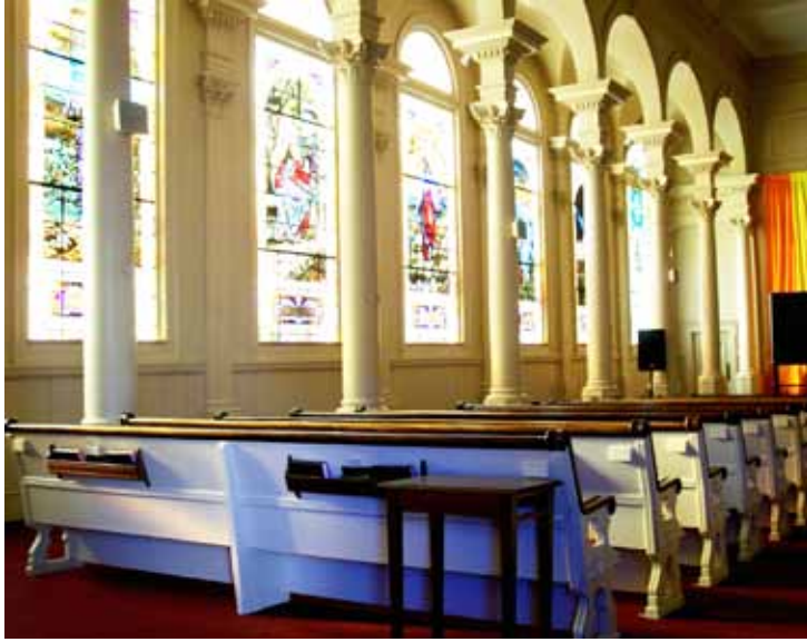
Interiors of Alameda Historic Landmarks intended for public use, such as the First Presbyterian Church on Santa Clara Avenue, should be protected under the Preservation Ordinance.

selective demolition and ordering street or sidewalk closures and erection of street or sidewalk barricades as interim abatement measures.