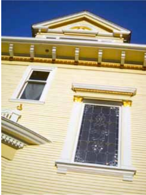
Details on the exterior. This view shows the upper stairwell window with Corinthian pilasters; the bay-window cornice with dentils and urn finial; and the roof eave with modillion brackets.