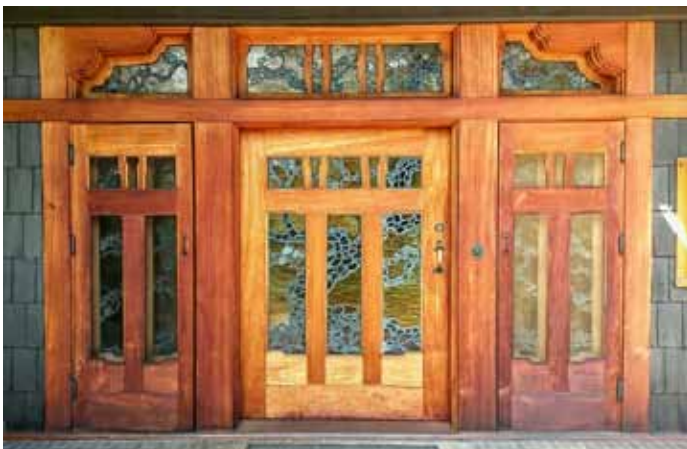
Front entry door, operable sidelights and fixed transom windows are filled with a stained glass masterpiece.

Additionally, if you have the time, an 11 minute drive from the Gamble House to the Huntington Library (1151 Oxford Rd., San Marino/ 10:00 am to 5:00 pm - closed on Tuesday) offers an extensive collection of Greene and Greene furniture and decorative arts in the Dorothy Collins Brown Wing of the Virginia Steel Scott Galleries of American Art.