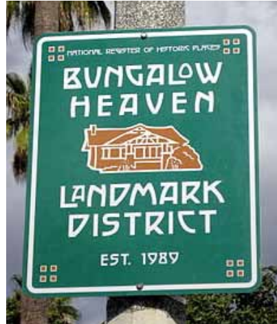
Street sign identifies a Pasadena neighborhood that is full of bungalows. The Planning Department adopted the area's nickname “Bungalow Heaven” when the City designated the area an historic district.

Most of the bungalows are one or one-and-a-half stories high, frequently have wide, street facing open covered porches with distinc-