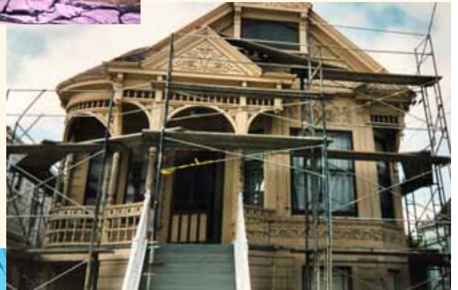
Once the stairs and balusters were installed, the next step was addressing the restoration of the original facade woodwork.