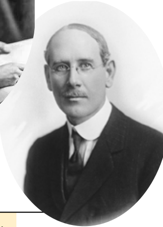
The brothers formed the architectural firm of Greene and Greene, established in Pasadena in January 1894.

tour to see the exteriors of nine other nearby Arroyo Terrace neighborhood Greene and Greene designed houses, plus houses designed by Arts and Crafts period architects Myron Hunt, Edwin Bergstrom, Elmer Grey and D.M. Renton.