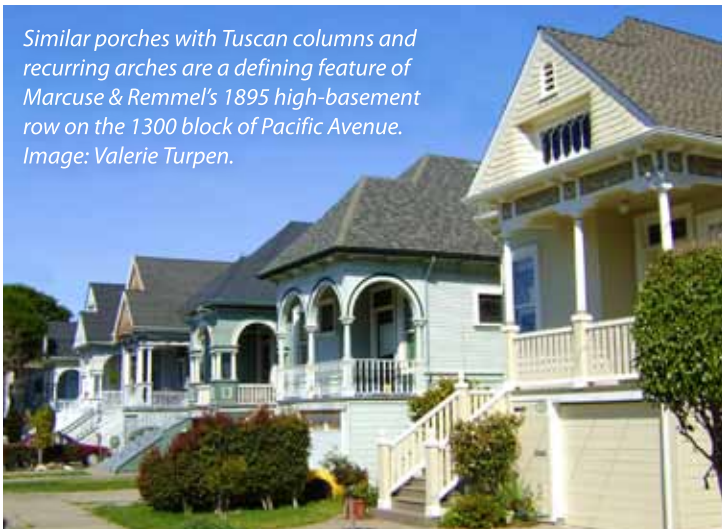
Similar porches with Tuscan columns and recurring arches are a defining feature of Marcuse & Remmel’s 1895 high-basement row on the 1300 block of Pacific Avenue.