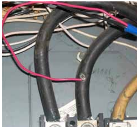
Electrical panels should be checked for dangerous conditions such as the improper "tap" above, which can lead to overheating and potentially an electrical fire.

Allen showed us various types of architectural features prone to wood-destruction including failed recessed wood gutters allowing water to pour into the stucco. Test holes are then needed at the side of the house to assess the damage.