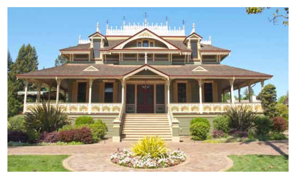
The McDonald Mansion. A landmark Stick Eastlake restoration and rehabilitation in Santa Rosa, California. This 5-year project involved restoring the original exterior of the McDonald Mansion, while making discrete additions to the rear of the property and integrating the house with its spacious gardens.

by the slow, organic accumulation of incremental changes, that good design can contribute to the quality of change, and that past mistakes can be corrected.