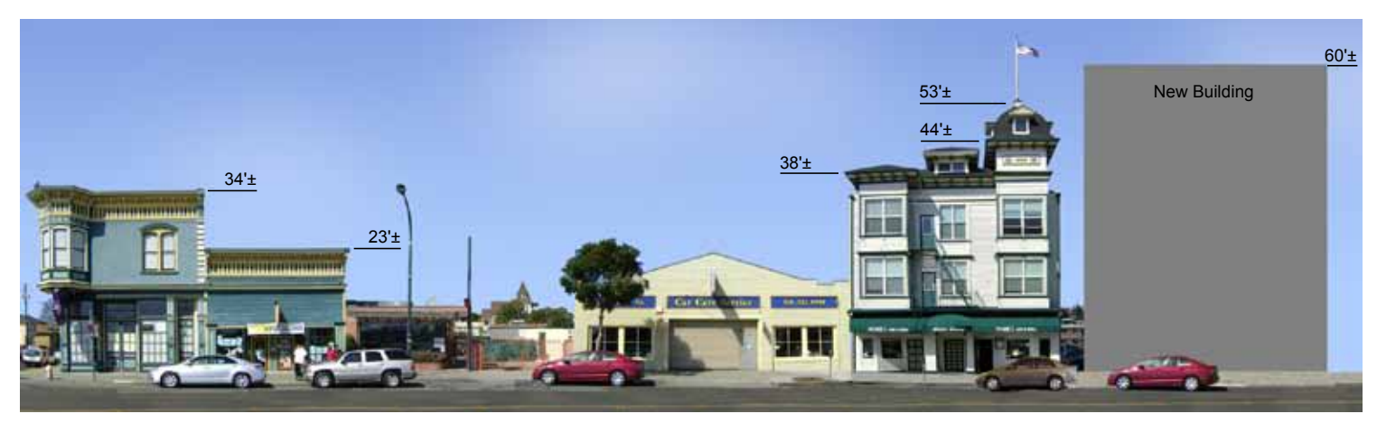
AAPS provided a scale depiction to the Alameda City Council of 60' building along the 1600 block of Park Street, next to McGee's building.