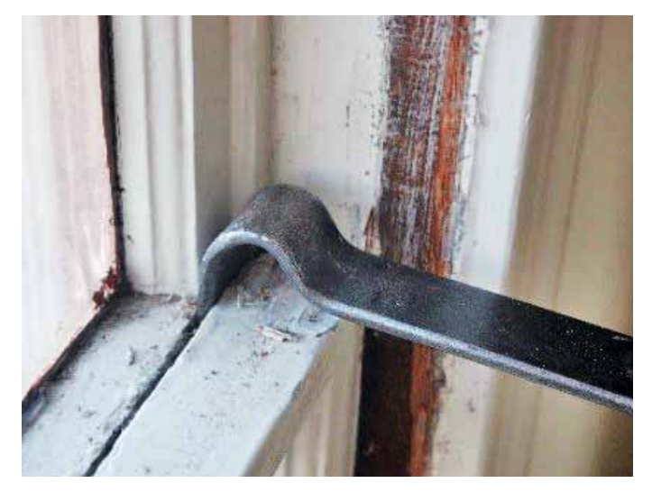
If the window is stuck in the frame, it is probably held by an exterior paint seam that you can't reach. To break this seam insert your pry bar between the upper and lower sash sides, as shown and pry gently. There will be a little "pop" when the outside seam breaks. With both side seams broken, the window should release.

Immanuel Lutheran Church: 1420 Lafayette Street, Alameda, CA (Parking available at the corner of Chestnut Street and Santa Clara Avenue.) FREE for AAPS Members; Non-members $5