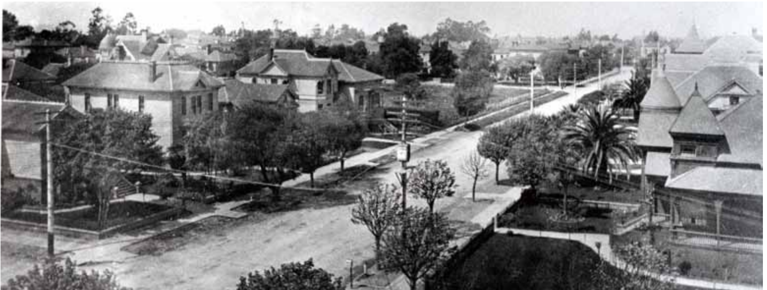
This is how Central Avenue appeared at the turn of the 20th century, looking west from a lofty upper story at the corner of Union Street. These blocks, which retain a number of historic houses, will be covered on the walk.

Free for Museum Members • $10 for Others