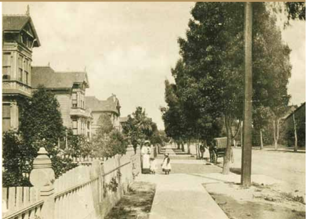
Looking east on Central Avenue from Benton Street in the early 1890s.