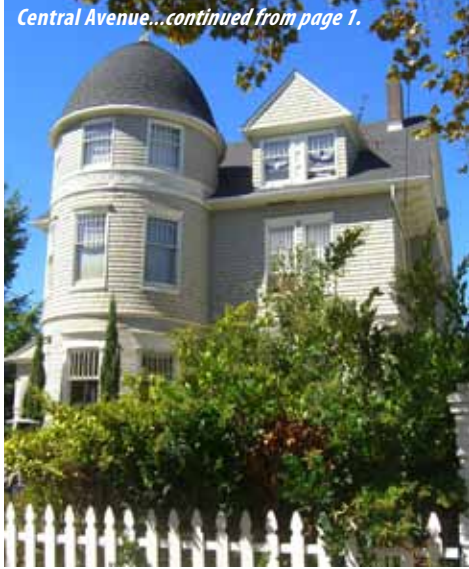
Central Avenue...continued from page 1.