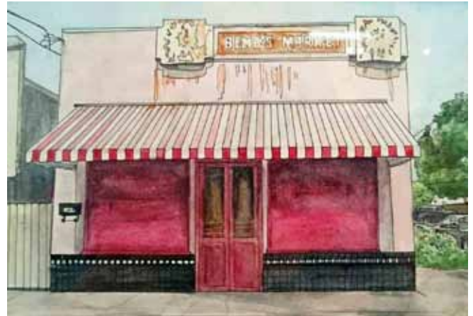
Walnut Street and Pacific Avenue. 18" x 20" framed. $150.

Contact Emily Phone: 510-502-6123 Website: emilybrockbonnes.com emily@emilybrockbonnes.com