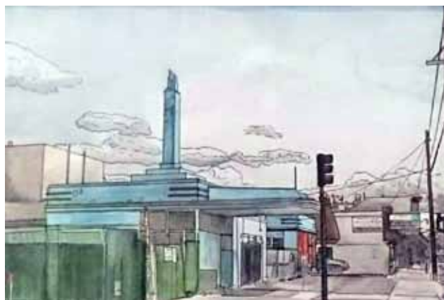
Oak Street and Encinal Avenue. 18" x 20" framed. $150.