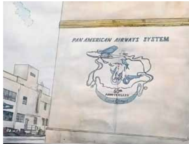
Pan Am. 18" x 20" framed. $150.