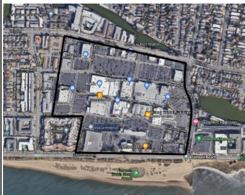
South Shore Shopping Center Add: CMU-MF, Community Mixed Use Multifamily Residential Overlay