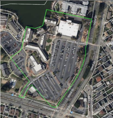
Harbor Bay Shopping Center Add: CMU-MF, Community Mixed Use Multifamily Residential Overlay