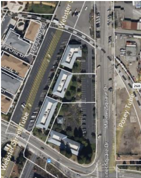
2363-2433 Mariner Square Drive – Rezone from Manufacturing to Residential.